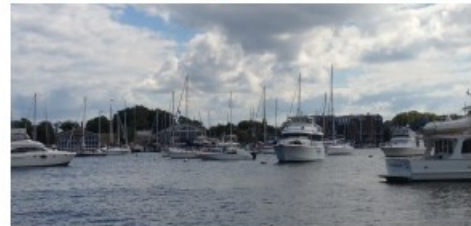
Phillips Crab Deck Downtown Annapolis