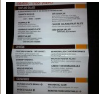
Zoes gluten free menu

1. We went to Zoes Kitchen for lunch on Saturday right after my sister picked us up! I had never hear of this restaurant and it was a delicious finding. It is a fast food type, but has good quality healthy choices. I had the Tomato Bisque soup and the Chicken Kabob which comes with braised white bean and a side greek salad. The food was delicious and the Kabob meal had such generous portions that I gave a whole kabob to my brother-in-law.